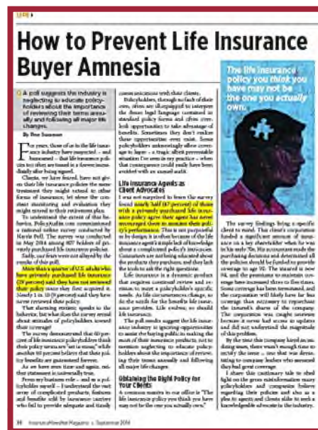
Feature in Insurance News Net magazine on PolicyAudits.com.