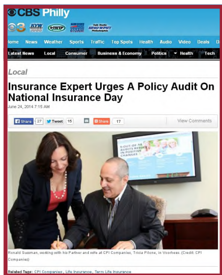
CPI Companies was featured on KYW Newsradio and CBSPhilly.com in June.